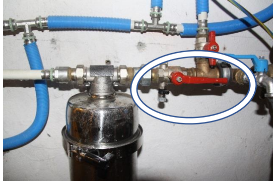
Open valve (parallel to the pipe)