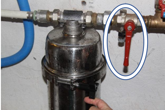
Closed valve (perpendicular to the pipe)