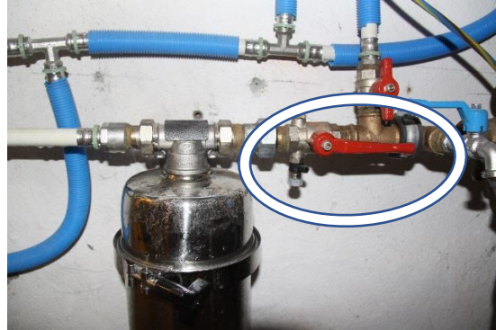
Open valve (parallel to the pipe)